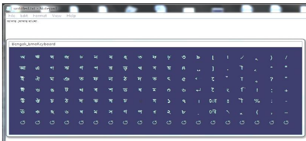
Figure 1: Writing with Bengali matrix speller on normal text document

Bengali Emo keyboard was mapped for the first time and there were a lot of things to be pointed out. The proposed matrix speller with only vertical or column flashing helps to select a character. For Bengali keyboard it was needed to place the most necessary vowels and consonants in near matrix cells. As the matrix flashing starts from the left each time and then follow the series. It takes slight extra time to select the last letter placed in the 19th column. It was examined during interface design and to apply the proposed algorithm less useable consonants, numbers and punctuations placed in the matrix after 10 th column. The advantages of the interface were like it can be useable with any web browser, windows default text, notepad and MS power point to write. The Fig. 1 shows that how a subject can write in normal windows text. As the alphabets were mapped with Unicode characters, so the file should be saved in Unicode format.