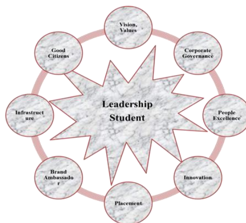
Figure.2 Outcomes of Proposed Model

The students subjected such a programme in the academic institutions will have acquired the values of life and will be able to survive in his life with increased moral values and lives a responsible life in his world and contributes to his personal and national growth. The outcomes and qualities of the leadership students were projected in Figure.2.